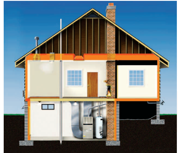
Where proper insulation works to keep homes warm in winter and cool in summer.